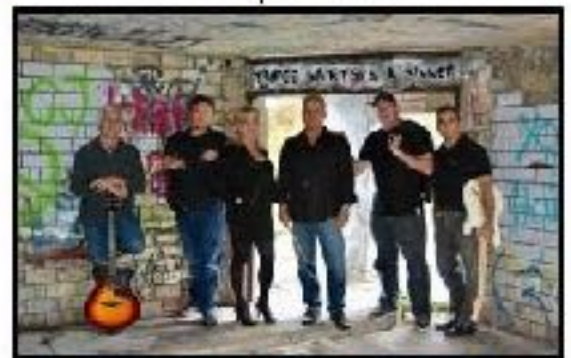
“THREE SAINTS AND A SINNER”